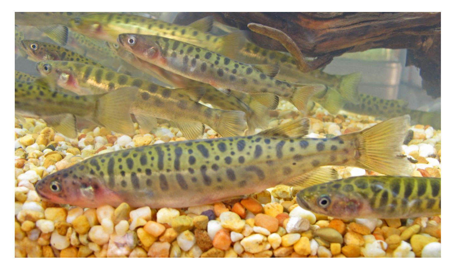
Picture 3. The striking markings of the golden galaxias are hard to appreciate in the turbid waters of Lake Crescent.

survey in Lake Crescent conducted in March 2016 found no sign of carp recruitment but revealed a healthy population of golden galaxias thriving around the lake. The effort of the commercial eel fishermen further supported that Lake Crescent is now carp free.