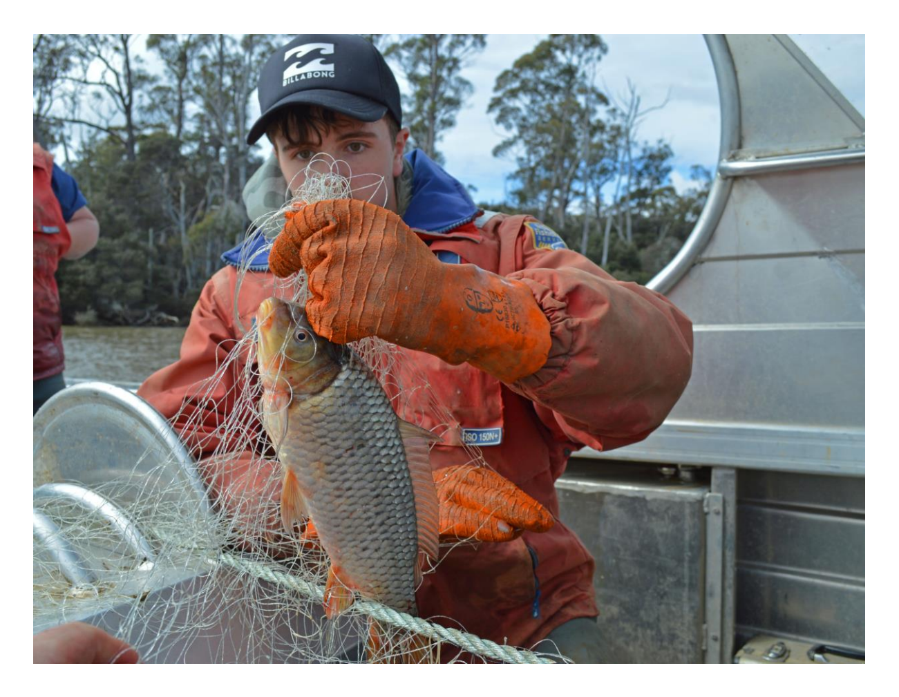
Picture 1. One of the seven carp caught over the Jul-Sep period. The fish was caught in a multi-monofilament gill net set over deep rocky shores.

coming season. In mid-September, the big fyke nets were sewn into the barrier nets around the lake. The big fyke nets are stitched into the barrier nets in strategic locations where carp are known to want to enter the marshes. They target maturing carp which are pushing into the shallows seeking warm water and spawning habitat. The big fyke nets will also be an indicator of when the carp have moved inshore, allowing gill nets to be set to catch them.