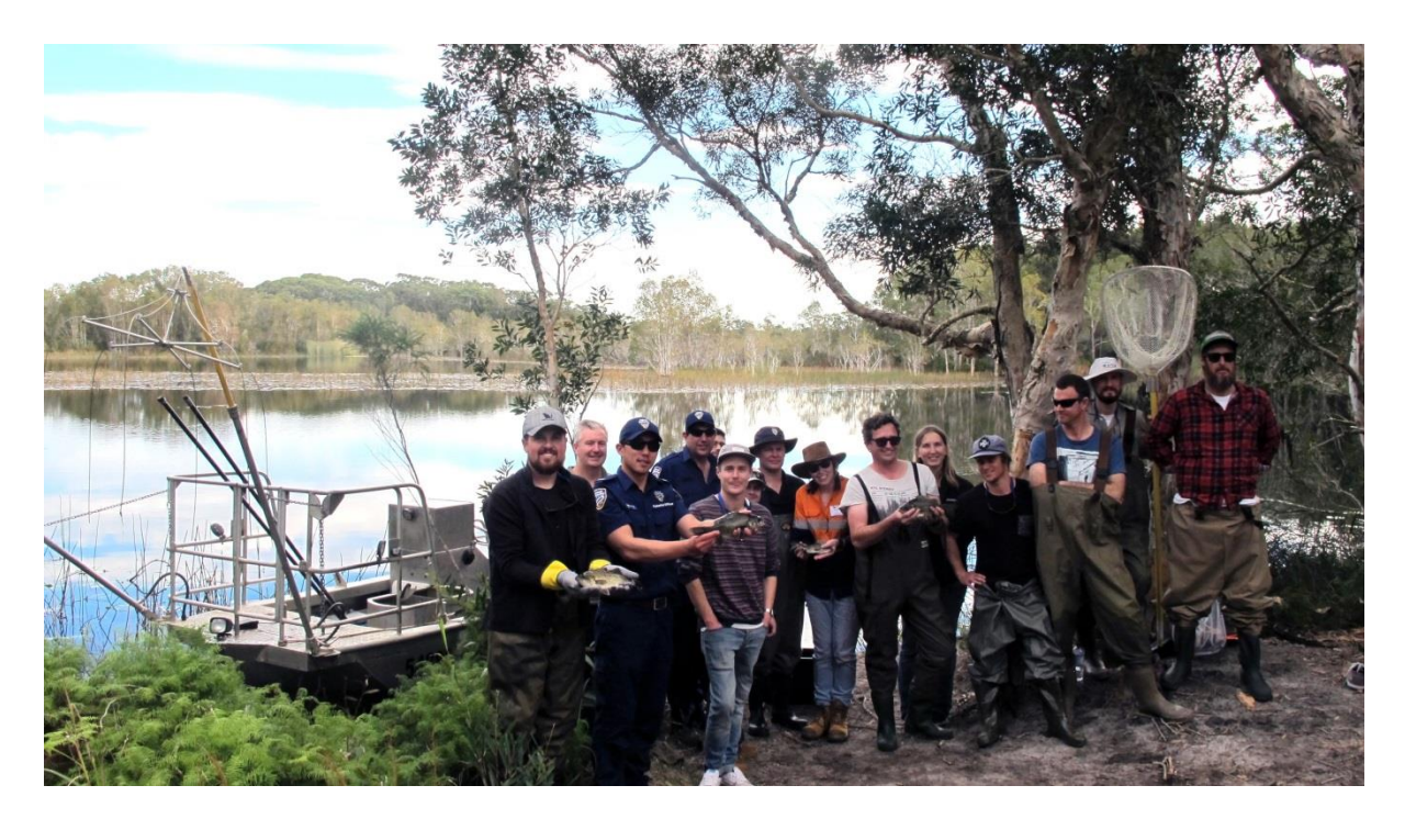
Picture 5. The electrofishing class at Blue Lagoon, Port Stephens undertaking the practical component of the course.