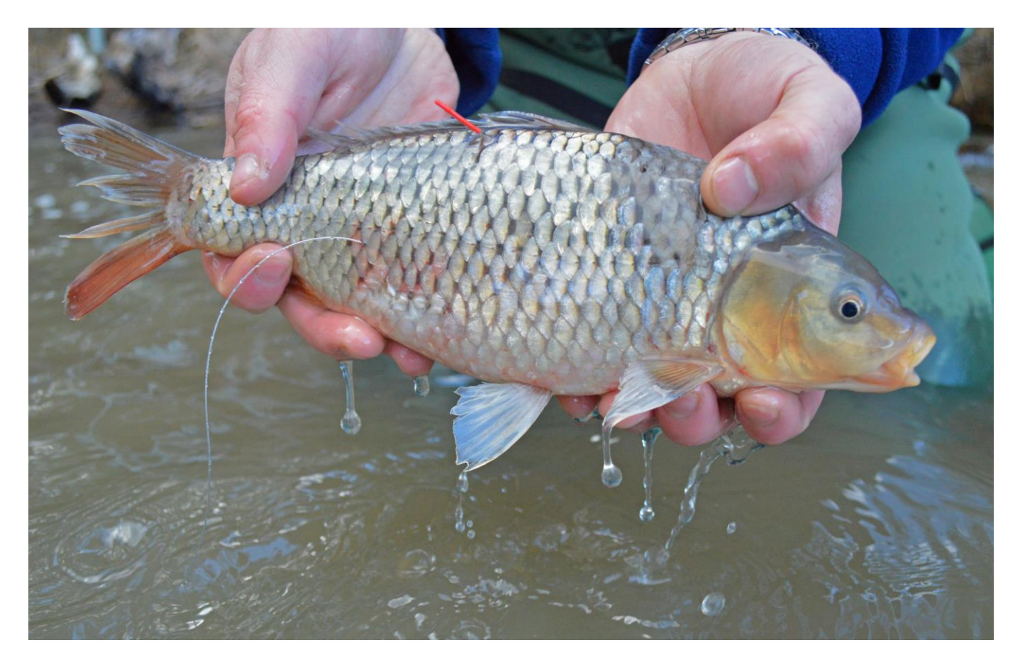
Picture 7. One of the 500gm adult male transmitter carp prior to release back into Lake Sorell.

more suited for the smaller sized fish. These transmitters also have a function which is able to tell CMP staff whether a fish has died prematurely or has managed to shed the tag. The four transmitter carp were released back into Lake Sorell in preparation for the start of the carp spawning season, which brings the total number of transmitter fish in Lake Sorell to 12. These transmitter fish will allow us to gain a better understanding of the movements of the carp population, indicate when the carp begin to move close to shore to look for spawning habitat, and hopefully result in more opportunities to target shallow water aggregations.