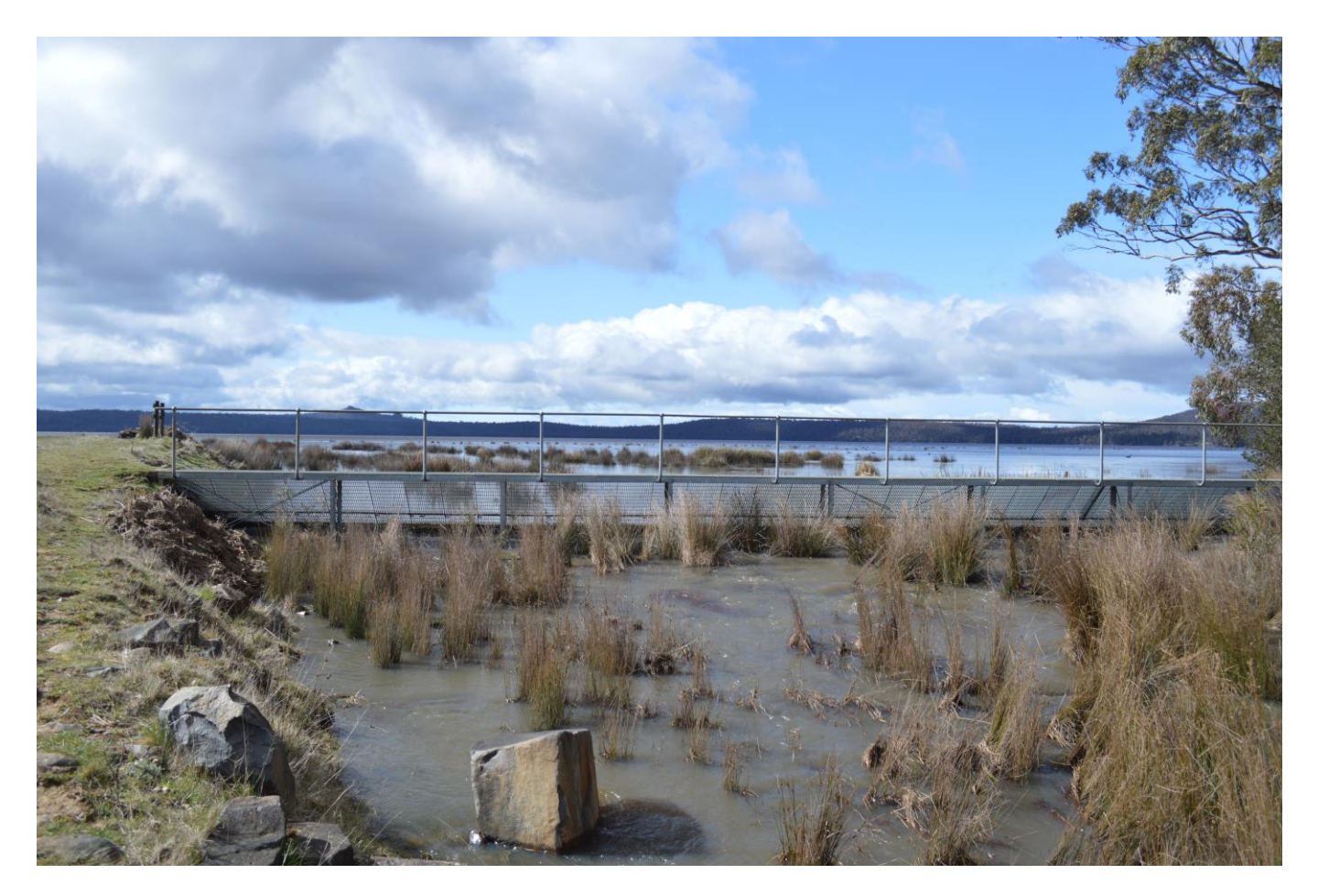
Picture 8. The Lake Crescent spillway screens overflowing with water as a result of the high lake levels at the start of winter.