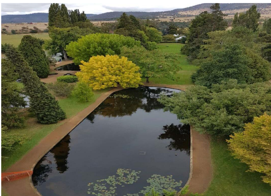
The Salmon Ponds

Unseasonably record warm weather during January, particularly over the Australia Day long weekend, created stress on the display fish within the grounds of the Salmon Ponds. This event caused high mortality and at least half our stock of rainbow trout from the long pond, albino pond and brook trout pond was lost. Deaths were attributed to water temperatures exceeding critical maximums for the survival of trout combined with low oxygen levels. The maximum water temperature recorded at the Salmon Ponds was 28 degrees. Additional oxygen will be added and stocking levels reduced to minimise the risk of a repeat occurrence next summer.