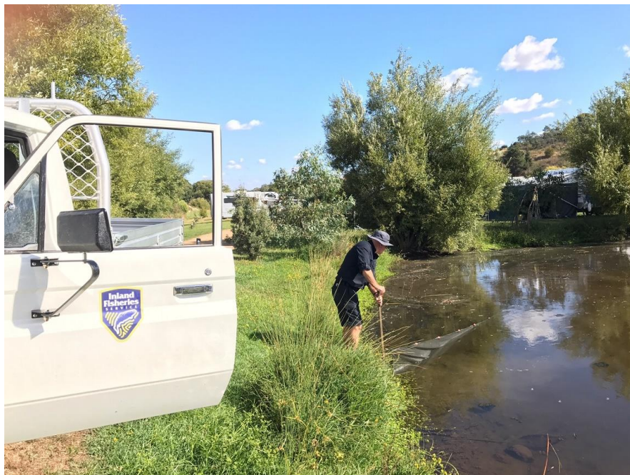
IFS manager Hatchery and Stocking surveying Queechy Park Pond for Gambusia

Distribution surveys indicate that this unwanted pest is isolated to one dam in this area and was most likely transferred by people.