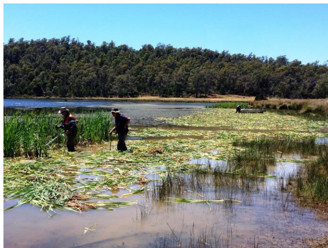
AAT cumbungi (bullrush) volunteers

We will undertake follow up treatment as required.