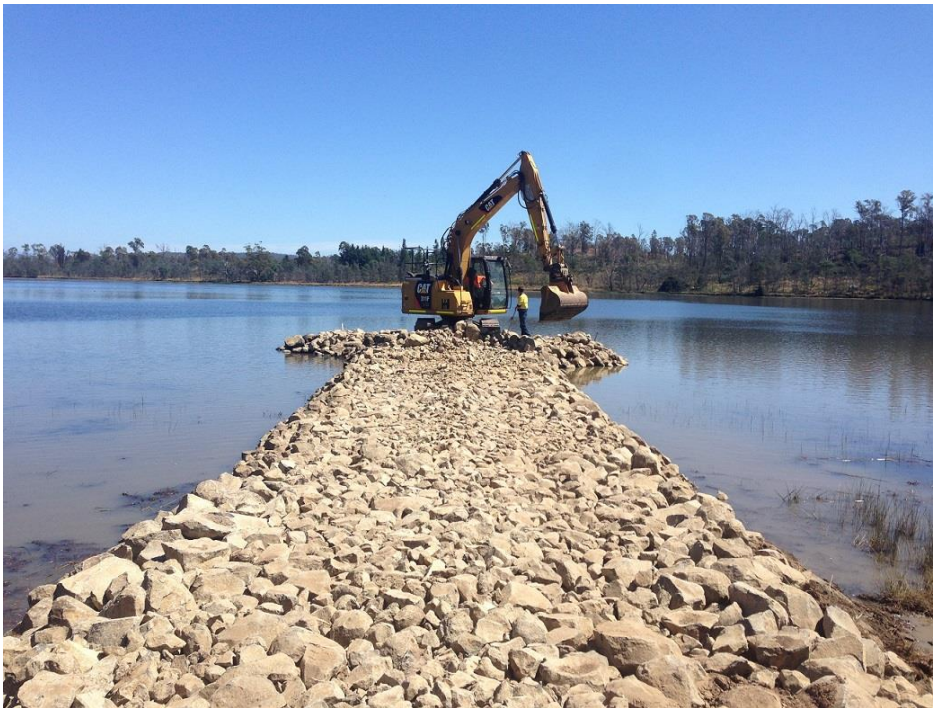
Accessible angling platform under construction at Four Springs Lake