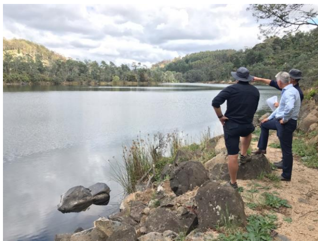
IFS and Dorset Council staff at Briseis Hole

It is planned to develop a fishery that caters for anglers of various ages and skill levels. Dorset Council is working to improve the access around Briseis Hole and we will assist the fishery by stocking with rainbow trout.