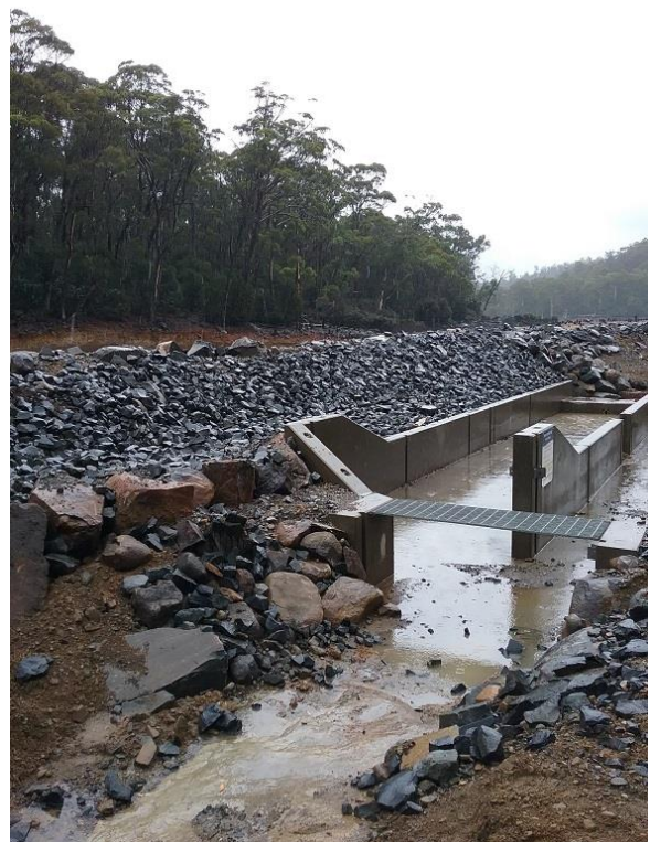
The River Derwent Fish Trap – Lake King William

With the level in Lake King William falling over summer, we took the opportunity to undertake an inspection of the trap. It was found that the levee bank, separating the trap from the river, needed further protection. Bluestone spalls, with an underlay of geo-fabric, were locked into the bank. This should provide greater protection of the infrastructure during high water events. The trap is now ready for the brown trout spawning run.